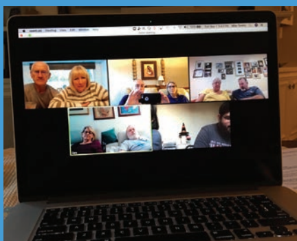
Houston Team 02 having their monthly meeting via Zoom.