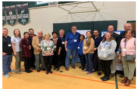
Teams of Our Lady attendees from Tyler, Texas and Louisiana