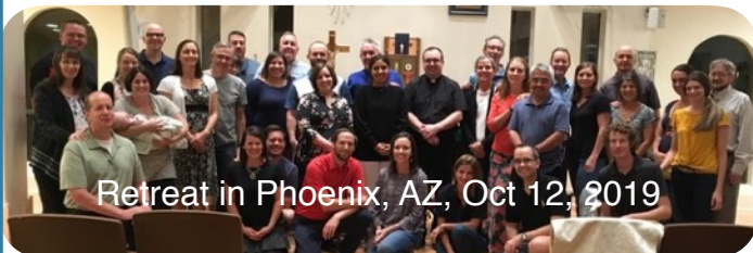
Retreat in Phoenix, AZ, Oct 12, 2019