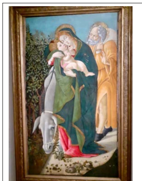
The Flight into Egypt, Botticelli