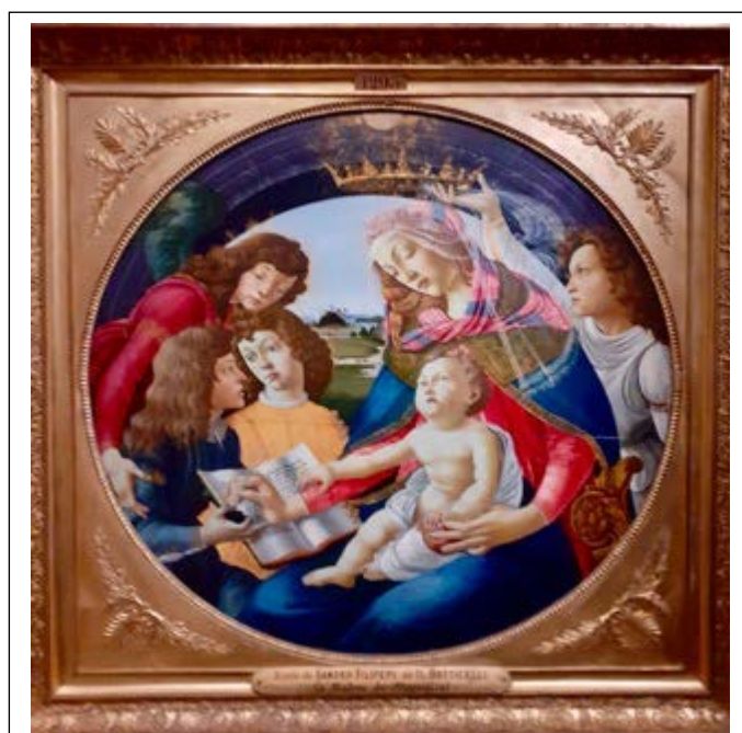
Madonna of the Magnificat Botticelli